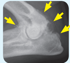
Arthritic elbow joint in a dog with lots of "fluffy" new bone (yellow arrows) around the joint, indicative of marked arthritis.