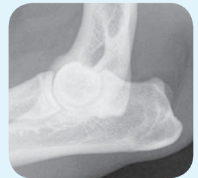
X-ray of a normal elbow joint

Radiography is commonly used to investigate joint problems.